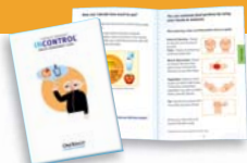
Insulin Management Guide

This coupon is good toward OneTouch® Products only.