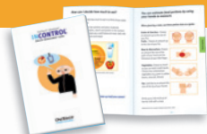
Insulin Management Guide

This coupon is good toward OneTouch® Products only.